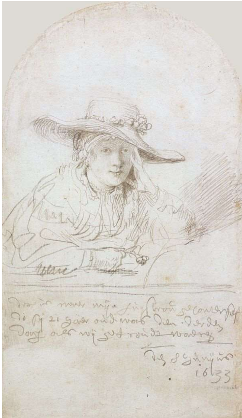
Rembrandt, The artist's bride of three days (detail) Silverpoint on prepared vellum, 18.5 x 10.7 cm Berlin, Kupferstichkabinett